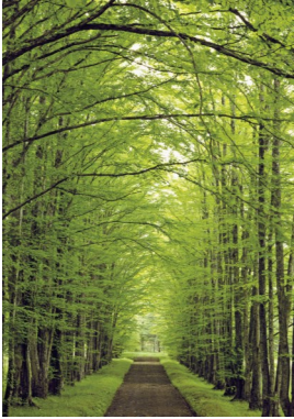
Trees provide a beautiful canopy

We had wonderful entries from our community for the Dumont Arbor Day 2013 Art and Poetry contest. Here are two poems from budding poets in our community: