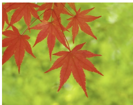
Healthy trees have full leaves through the summer